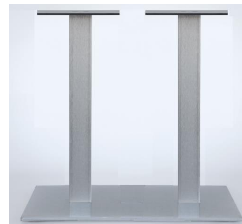
Shown with Double 4" Square Column

Please specify finish when placing order: Wrinkle Black (WB). Matte Black (MB). Silver (SV). White (WH). Satin Chrome (SC).