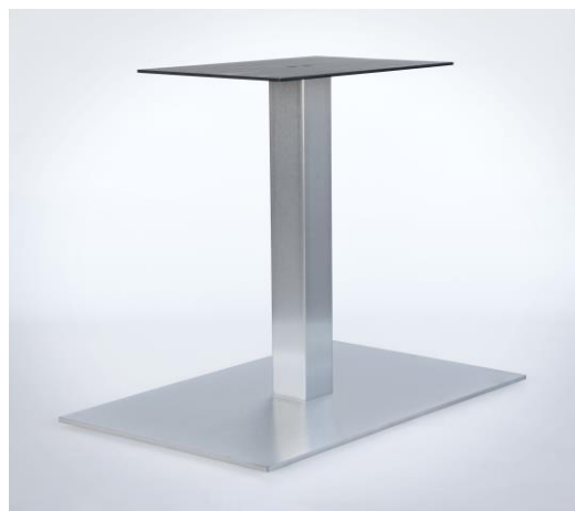
Shown with 4" Square Column