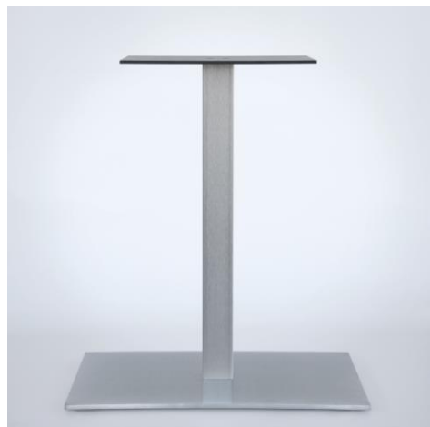
Shown with 3" Square Column